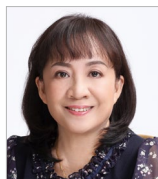
教育主任 Education Executive