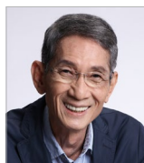
研究及發展部研究員 樂器研究改革主任 Research Fellow, Research and Development Department Research & Development Officer (Musical Instrument)