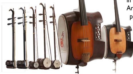
環保鼎式高胡、環保高胡、環保中胡、環保二胡、環保低音革胡、環保革胡 Ding-style Eco-Gaohu, Eco-Gaohu, Eco-Zhonghu, Eco-Erhu, Eco-Bass Gehu, Eco-Gehu